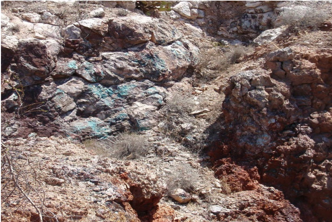
Figure 4. Drone Imagery of surface sulphide mineralization exposed in historic exploratory trenching